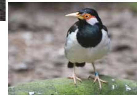
Javan Pied Starling.jpg