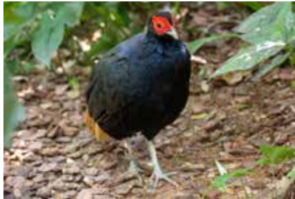
Malayan Crestless Fireback.jpg