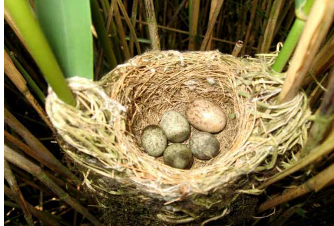
Lesser reed warbler eggs ( Acrocephalus scirpaceus )

The dimensions of the aviary are not overly large (5x2.5x2 meters) and this space is shared with a couple of snowy crowned robin chats and grey wagtails.