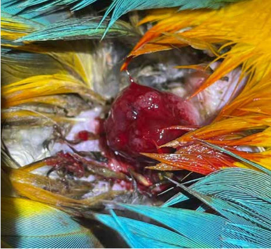
Papillomas in a Blue and Gold Macaw Tony Silva

Some week ago I posted the photos and text below. I want to give an update. The last photograph was taken by pest.