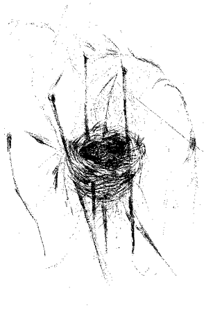
Reed warbler\Reed warbler nest drawing (Els Kanen-Schets)

The reed warbler breeds in reed collars, the nest is woven from grass stems and flower buds, leaves and flowering stems from reed, plant fluff and cobwebs. Lined with fine plant fibers, sometimes hair, wool and feathers, it is attached to rarely