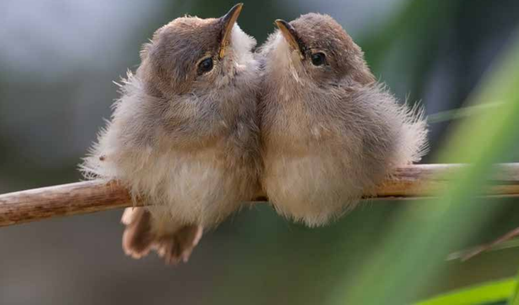
Lesser reed warbler eggs ( Acrophalus scirpaceus )

Who doesn't know him? This little bird is probably very well known to the general public, but far fewer people will be able to say that they have heard this bird, and very few who have actually seen it! The great fame in name is probably in the remarkable nest building in the reeds, but certainly also the bird enjoys the dubious fame as a host bird for the cuckoo. And indeed the reed warbler functions as a host bird, just like many other species (hedge sparrow, wagtail, redstart, pipit, etc.).