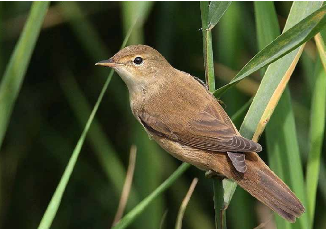
Lesser reed warbler ( Acrocephalus scirpaceus )

As food they get an insect pate, with pinkies, wax moth larvae, white mealworms, crickets and fruit flies. Everything dusted with a vitamin and mineral supplement.