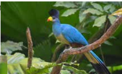
Great Blue Turaco.jpg