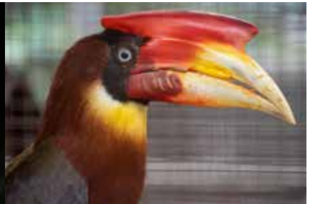
Mindanao Rufous Hornbill