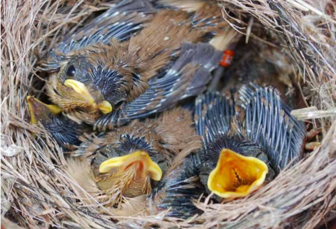
Lesser reed warbler chicks ( Acrocephalus scirpaceus )