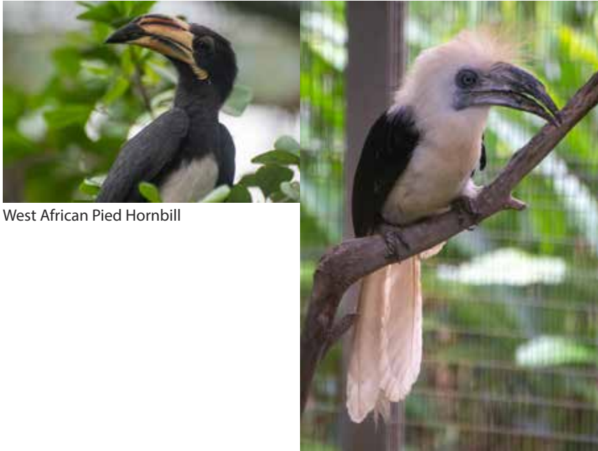
West African Pied Hornbill