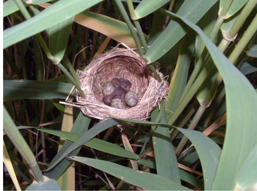
Lesser reed warbler eggs ( Acrocephalus scirpaceus )

The reed warbler breeds in reed collars, the nest is woven from grass stems and flower buds, leaves and flowering stems from reed, plant fluff and cobwebs. Lined with fine plant fibers, sometimes hair, wool and feathers, it is attached to rarely less than 6 reeds, half to a meter above the water's surface.