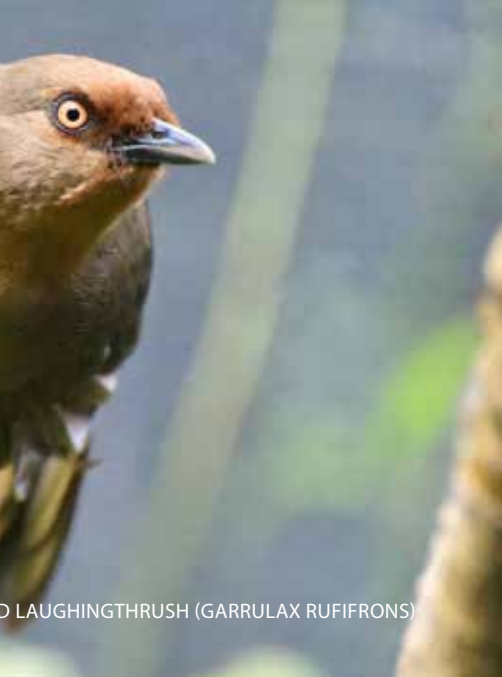
D LAUGHINGTHRUSH (GARRULAX RUFIFRONS)