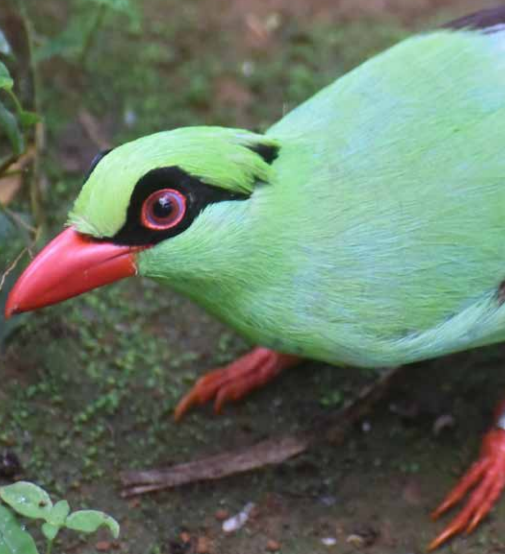
JAVAN GREEN MAGPIE (CISSA THALASSINA)