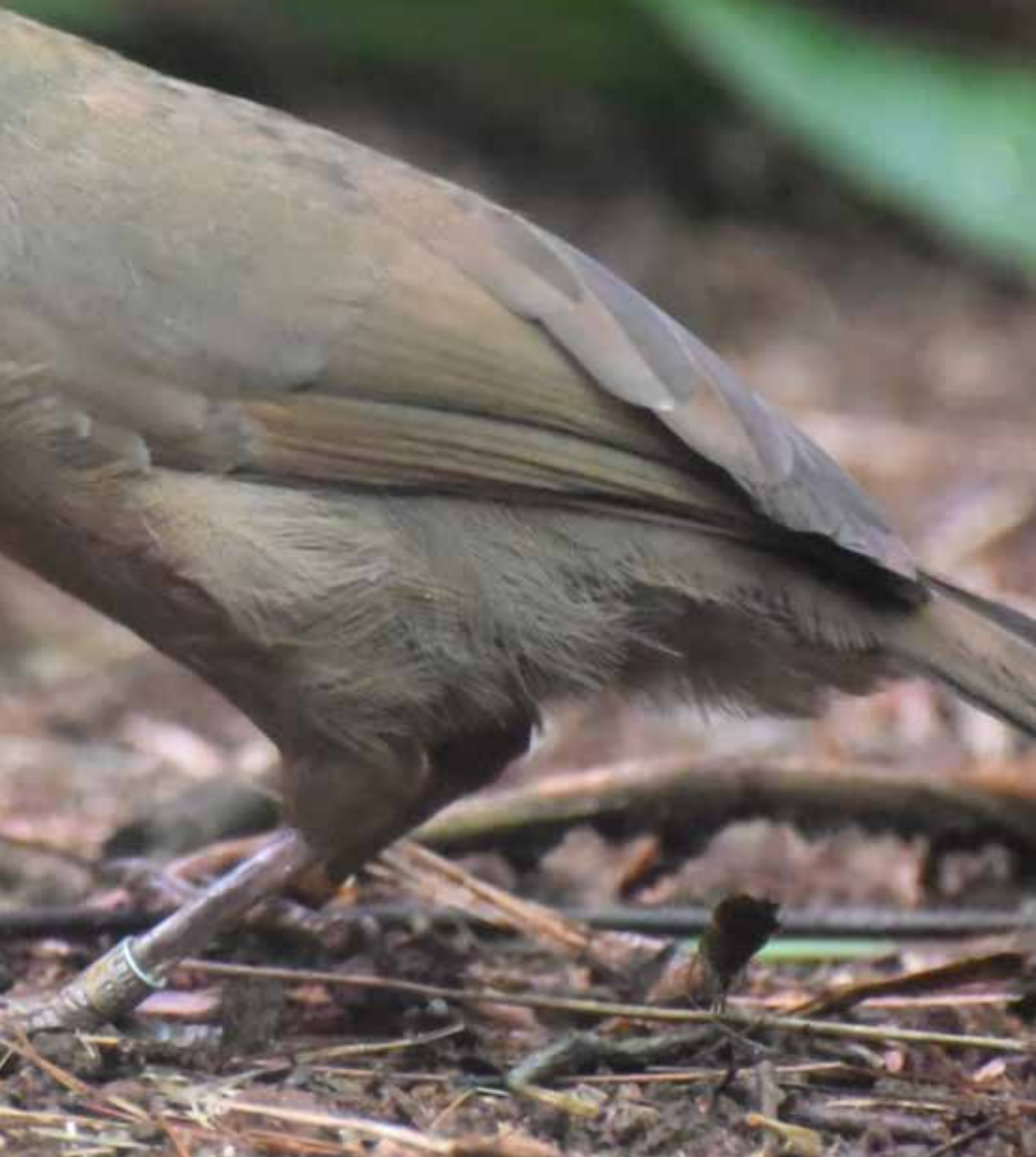
RUFOUS-FRONTED LAUGHINGTHRUSH ( GARRULAX RUFIFRONS )