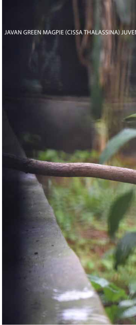
JAVAN GREEN MAGPIE ( CISSA THALASSINA ) JUVENILE

forest' - promoting awareness of the wildlife trade. A recent confiscation at LAX shows the popularity of these birds worldwide, with 5-6 yellow-breasted magpie ( Cissa hypoleuca ) being found dead on arrival.