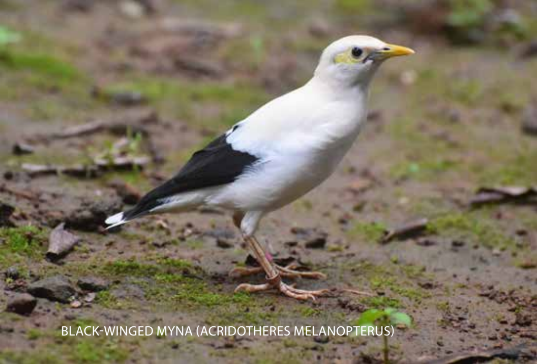
BLACK-WINGED MYNA ( ACRIDOTHERES MELANOPTERUS )