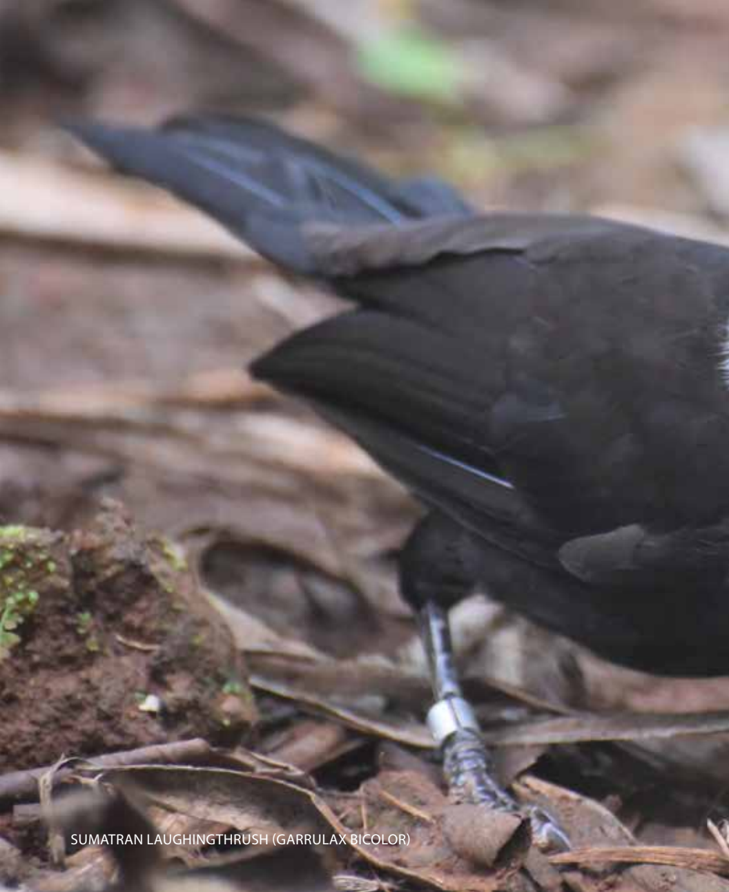
SUMATRAN LAUGHINGTHRUSH (GARRULAX BICOLOR)