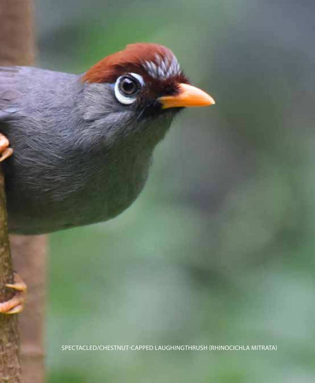
SPECTACLED/CHESTNUT-CAPPED LAUGHINGTHRUSH ( RHINOCICHLA MITRATA )

This species was acquired as a non-endangered species of laughingthrush, allowing the CCBC staff to gain experience with this group before working with more endangered species. The last remaining birds are due to be