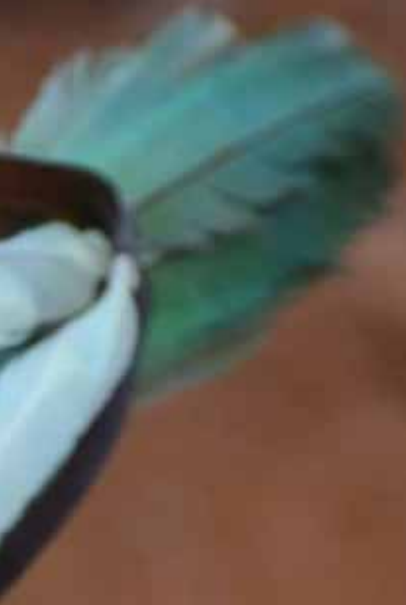
JUVENILE JAVAN GREEN MAGPIE ( CISSA THALASSINA )