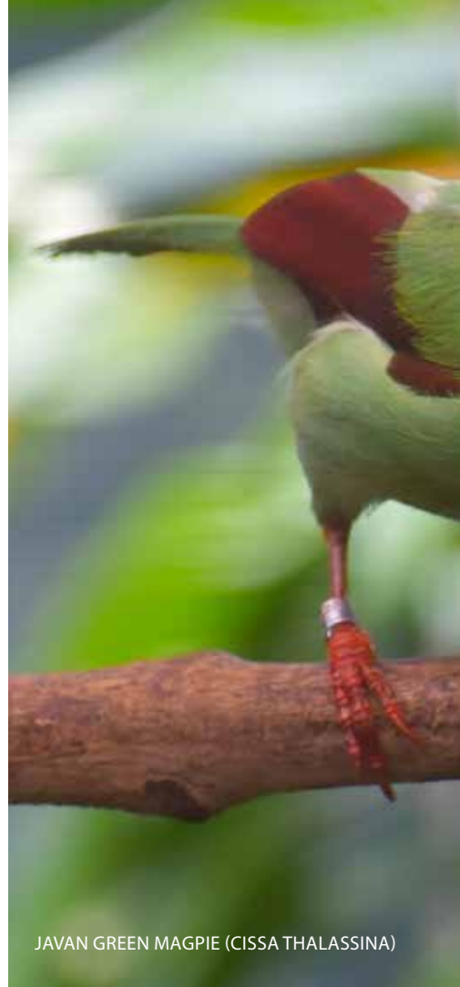
JAVAN GREEN MAGPIE (CISSA THALASSINA)

The Black-winged Myna is the only species kept at CCBC to have been reintroduced into the wild. This was the first reintroduction of a bird from a captive population on the island of Java, and only the second in Indonesia. A trial release in Cikananga took place in 2012, with further releases occurring in Halimun Salak National Park and Rawadanau Nature Reserve. The birds survived, being observed for several months afterwards and found to have bred in Haliman. Being such a desirable bird, the demand from the cage bird trade did affect populations but a lot of information was learned about release protocols and the importance of education. CCBC is working hard in local communities to raise awareness of the importance of the Black-winged Myna.