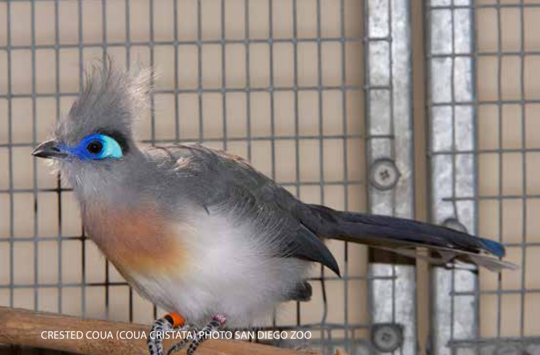
CRESTED COUA (COUA CRISTATA)