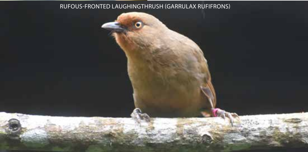
RUFOUS-FRONTED LAUGHINGTHRUSH (GARRULAX RUFIFRONS)