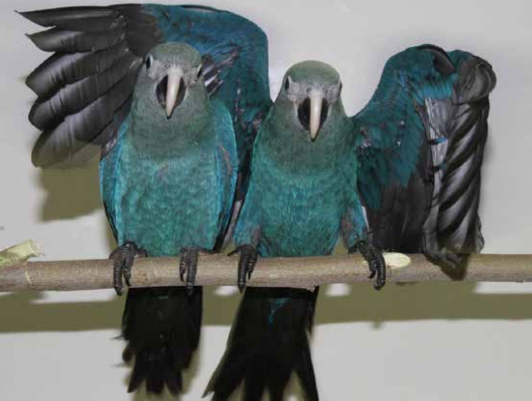
SPIX'S MACAWS (CYANOPSITTA SPIXII)