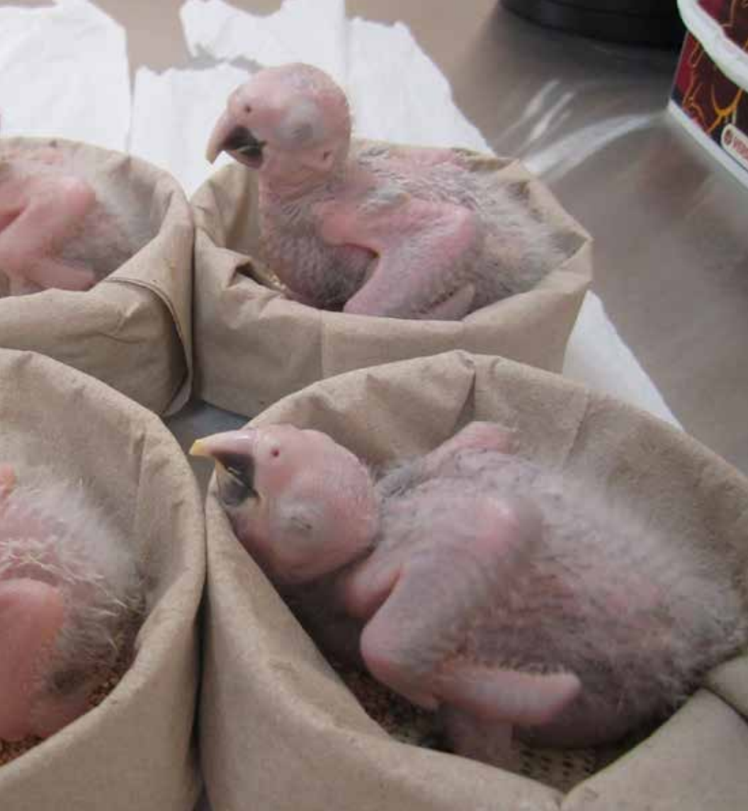
NEW BABIES (CYANOPSITTA SPIXII)

The increased exercise and dietary changes, plus an improvement in nest-box design for the Lear's, are examples of Cromwell's creative thinking. His theories put into practice have very important implications for captive management of other endangered bird species.