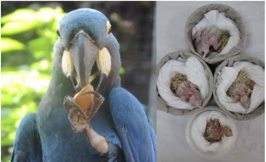
Captive Lear's macaw at Loro Parque in Tenerife. This species is listed as Endangered on the IUCN Red List Inset: in 2013, AI Wabra Wildlife Preservation and consultants from Germany successfully used artificial insemination (AI) with the Critically Endangered Spix's macaw. The biggest and smallest chicks (top and bottom) are the two bred using AI.

In short, he is managing a captive population and overseeing the