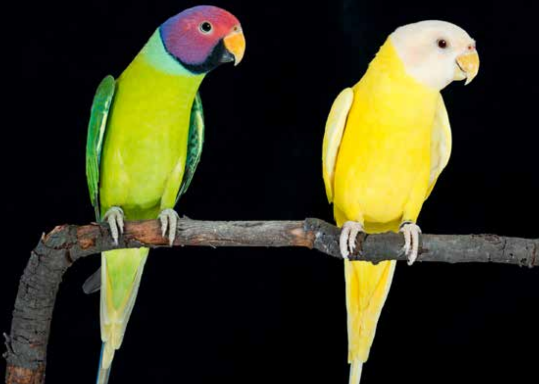
NOMINATE PLUMHEADED PARAKEET (PSITTACULA CYANOCEPHALA) MALE, RIGHT AND LUTINO FEMALE, LEFT

smoothly and I was excited to go back the following year.