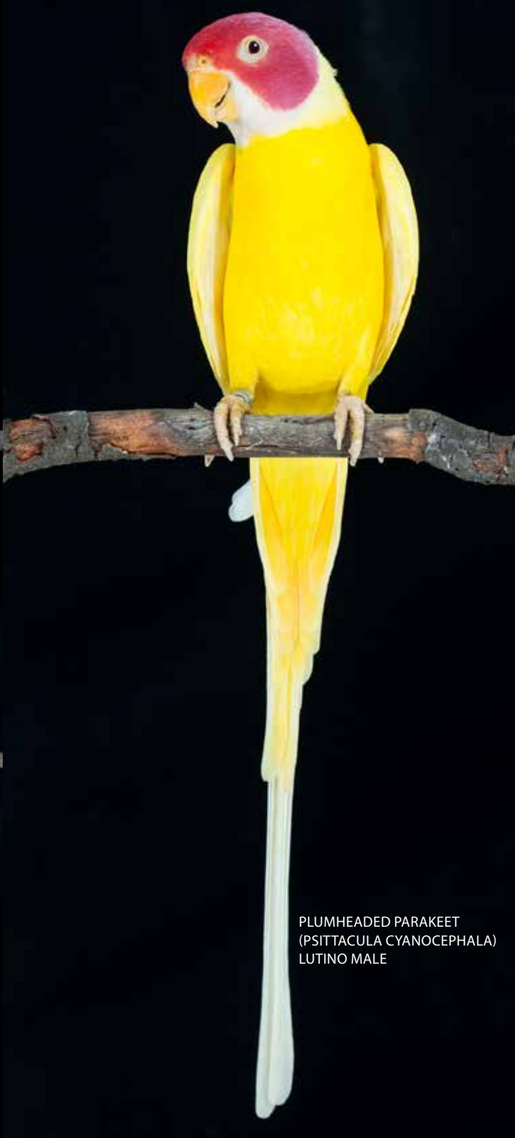
PLUMHEADED PARAKEET (PSITTACULA CYANOCEPHALA) LUTINO MALE