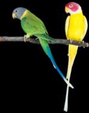
NOMINATE FEMALE & LUTINO MALE