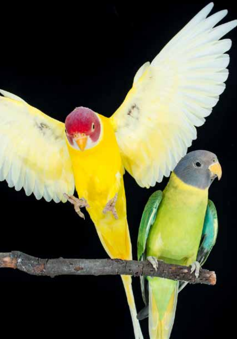
COCKATIEL (PSITTACULA CYANOCEPHALA) LUTINO MALE AND NORMAL FEMALE

cocks in full color on the perch in California. This is truly one of my proudest achievements. My passion for mutation colored birds started when I was a young boy and still exists today. I continue to travel the globe in search of new mutations