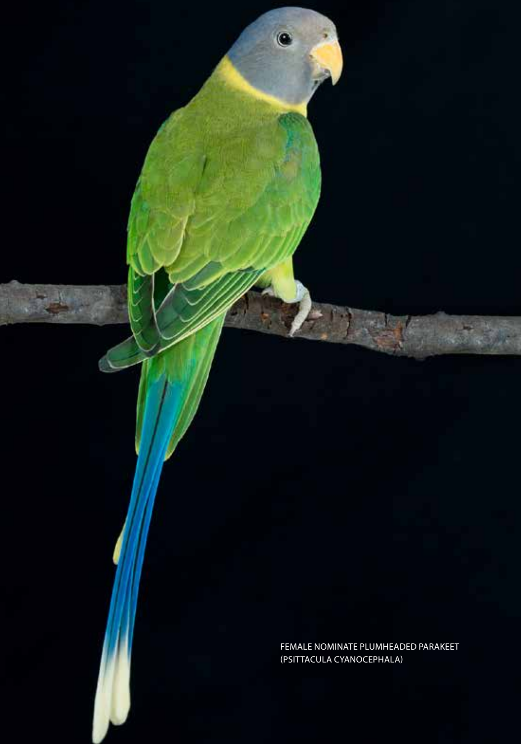
FEMALE NOMINATE PLUMHEADED PARAKEET ( PSITTACULA CYANOCEPHALA )