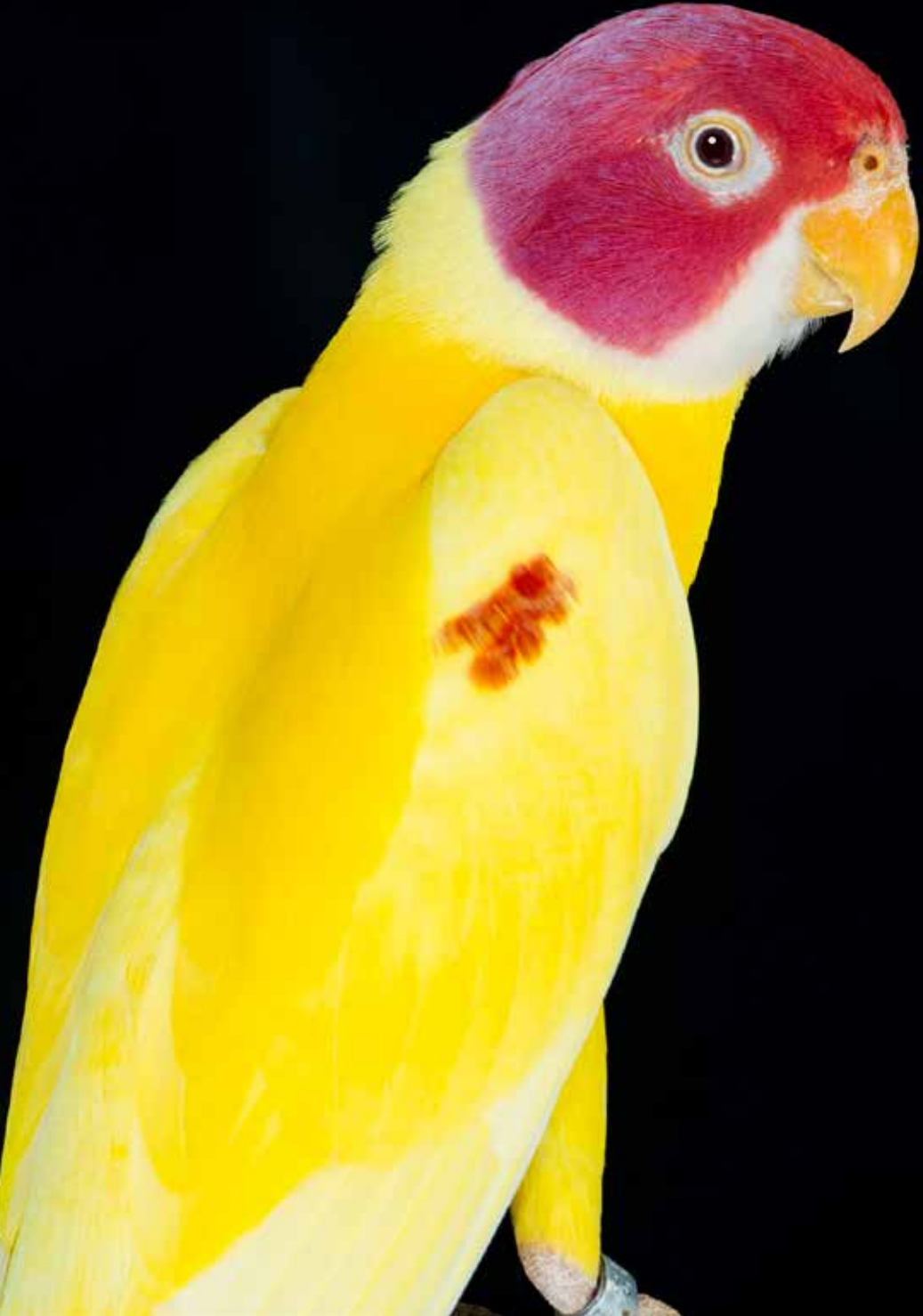
PLUMHEADED PARAKEET ( PSITTACULA CYANOCEPHALA ) LUTINO MALE