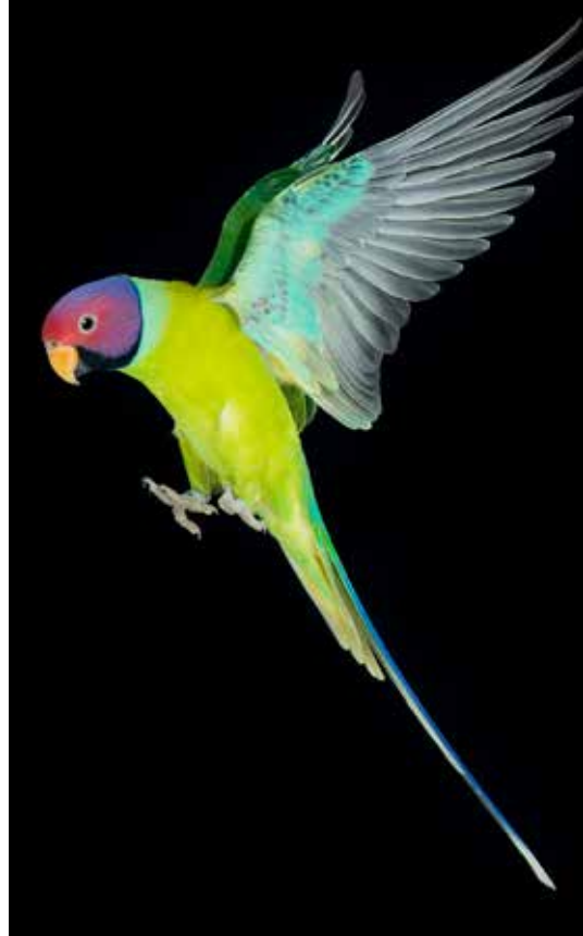
NOMINATE MALE PLUMHEADED PARAKEET (PSITTACULA CYANOCEPHALA)