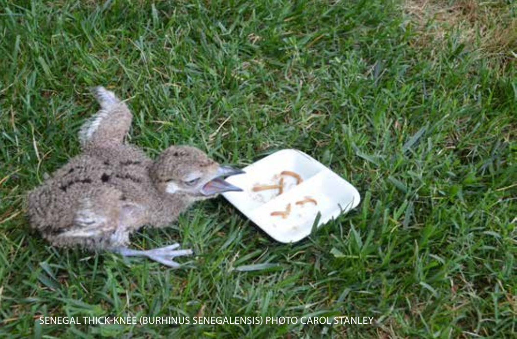
SENEGAL THICK-KNEE ( BURHINUS SENEGALENSIS )