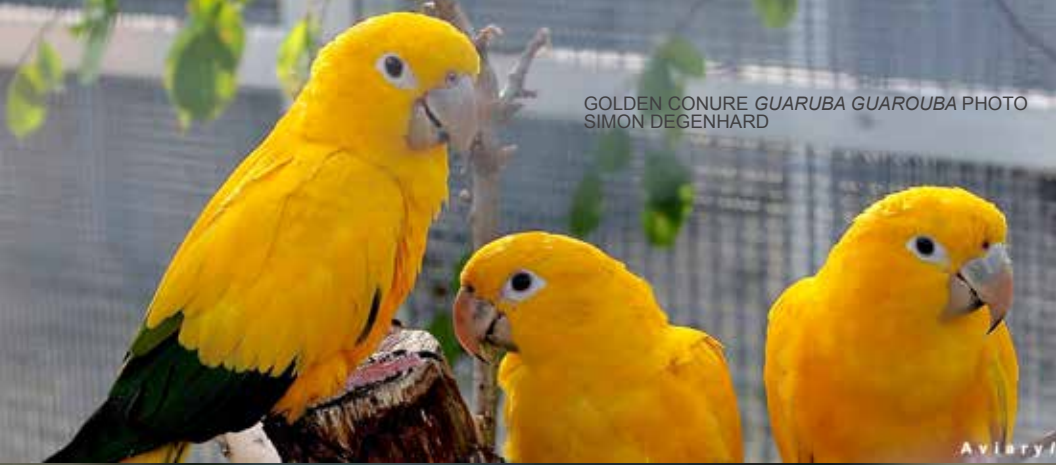
GOLDEN CONURE GUARUBA GUARUBA