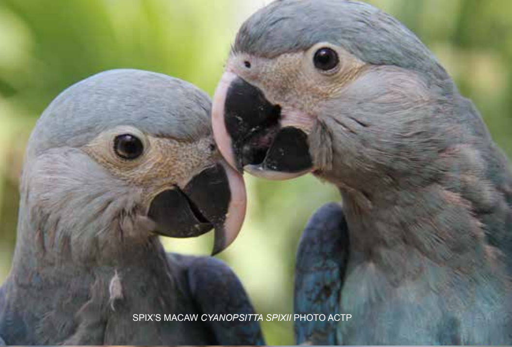
SPIX'S MACAW CYANOPSITTA SPIXII