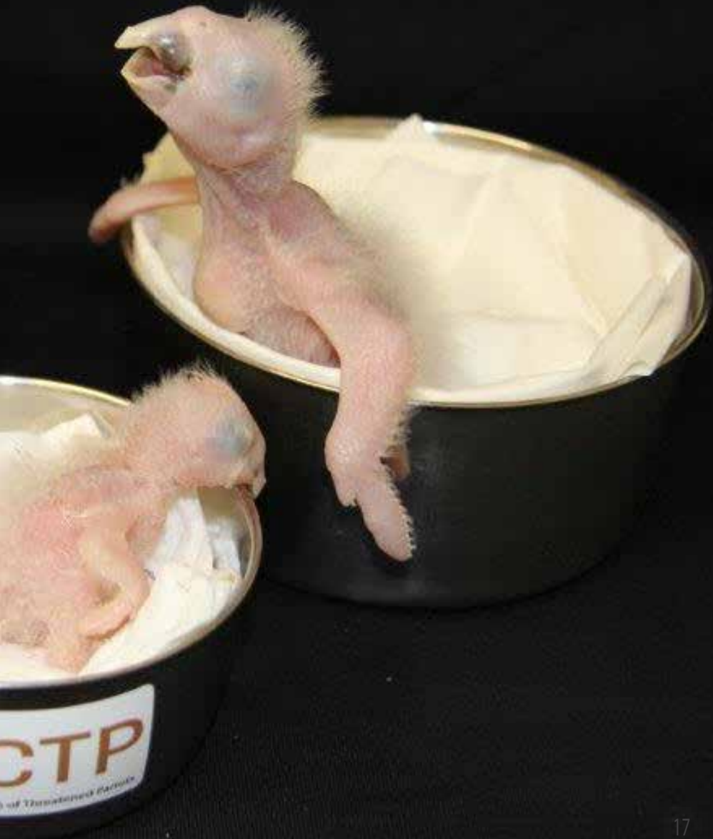
SPIX'S MACAW CYANOPSITTA SPIXII

represents the first breeding of the Spix's Macaw worldwide for 2015! Huge congratulations go out to the whole ACTP Team on this most recent success. 🦜