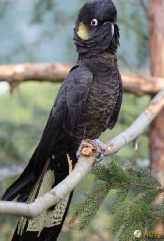
YELLOW-TAILED BLACK COCKATOO CALYPTORHYNCHUS FUNEREUS