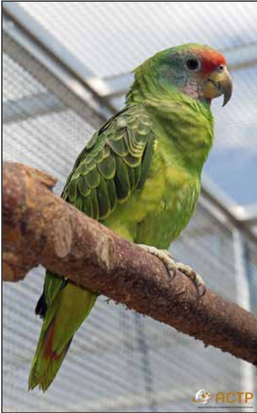
RED-TAILED AMAZON AMAZONA BRASILIENSIS

The facility has been designed with the housing and breeding of