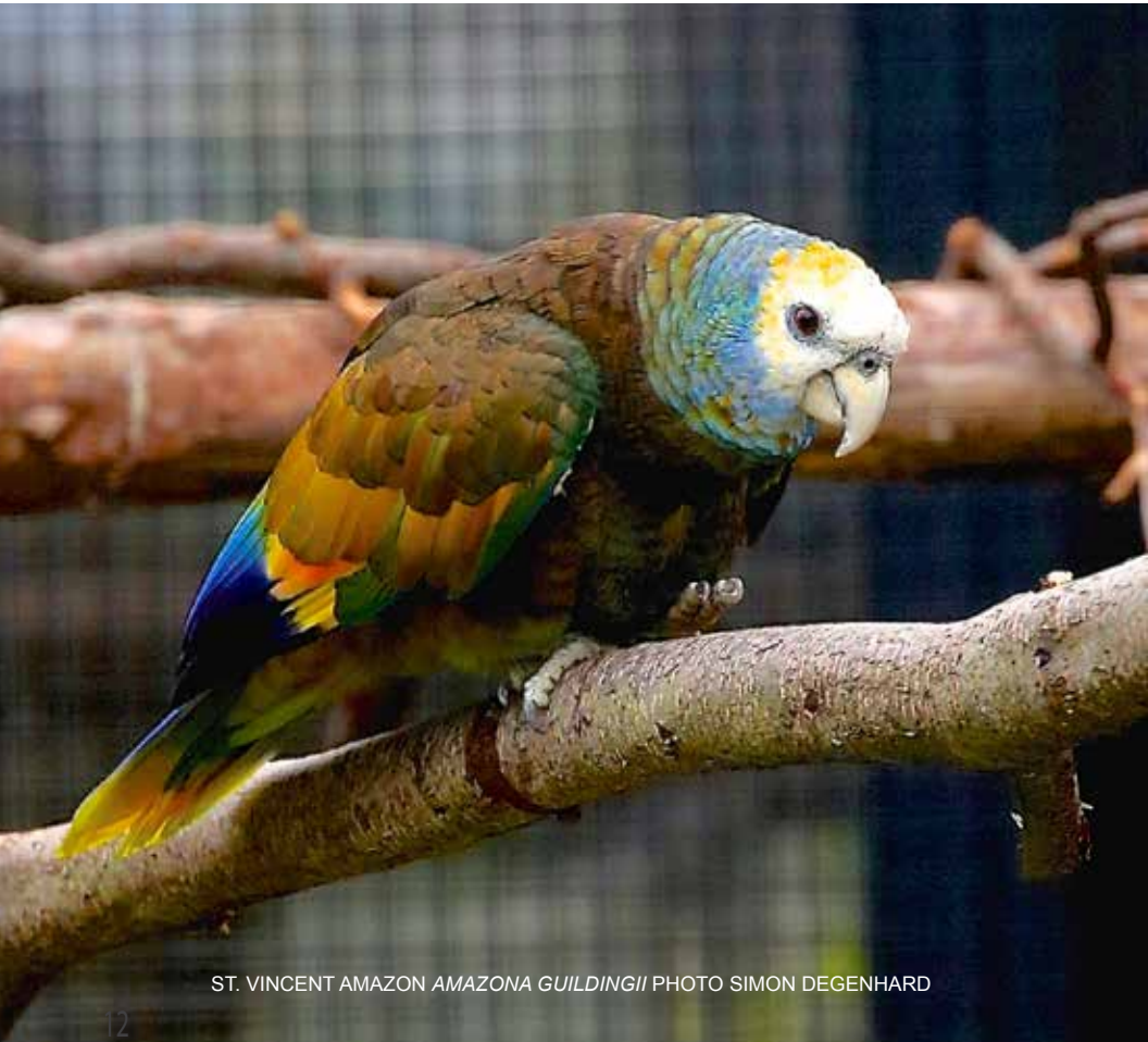
ST. VINCENT AMAZON AMAZONA GUILDINGII