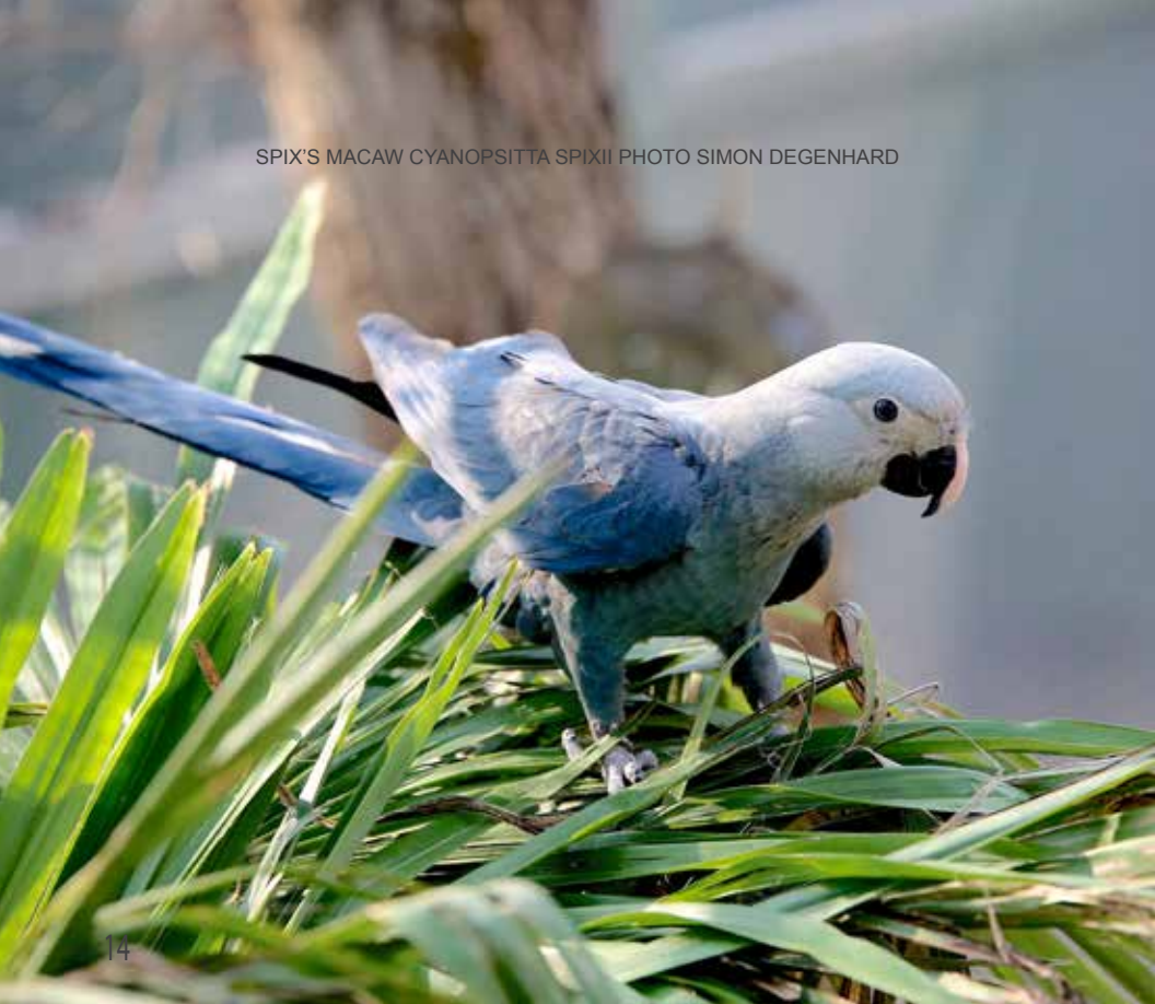
SPIX'S MACAW CYANOPSITTA SPIXII