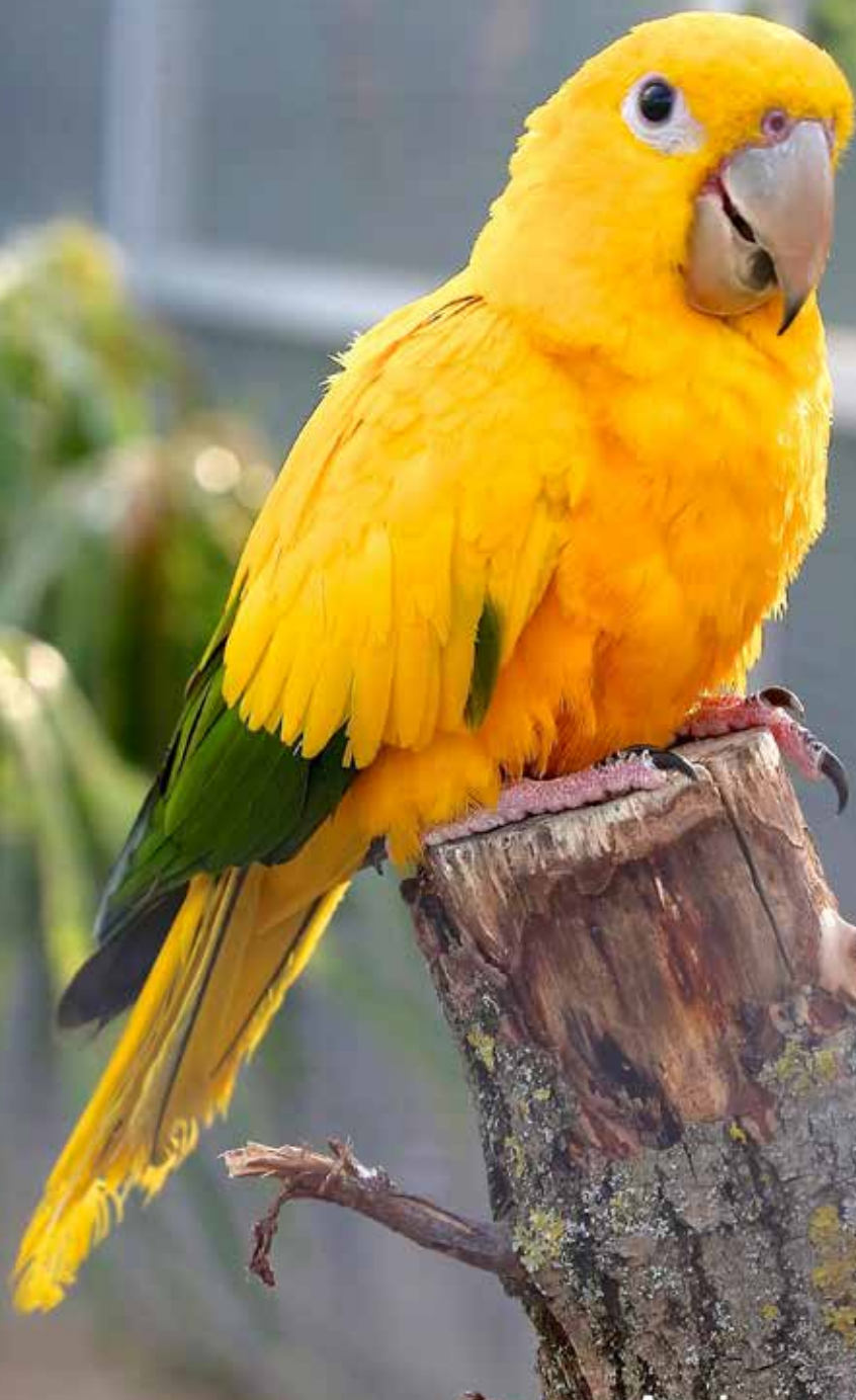
GOLDEN CONURE GUARUBA GUAROUBA