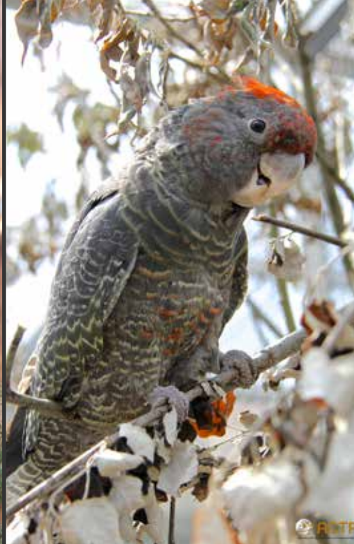
GANG-GANG COCKATOO CALLOCEPHALON FIMBRIATUM