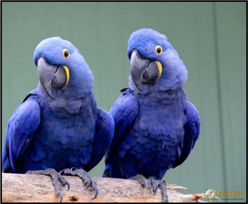
HYACINTH MACAW ANODORHYNCHUS HYACINTHINUS