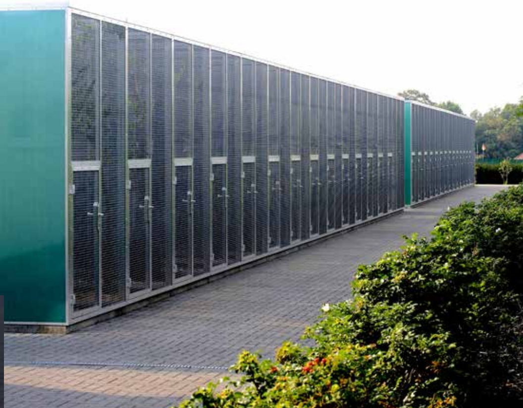
SAINT LUCIA AMAZON AMAZONA VERSICOLOR